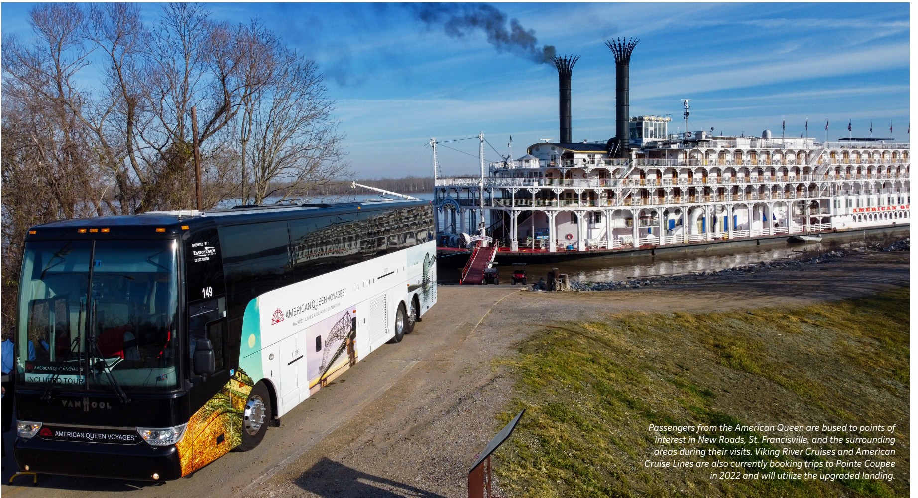
Passengers from the American Queen are bused to points of interest in New Roads, St. Francisville, and the surrounding areas during their visits. Viking River Cruises and American Cruise Lines are also currently booking trips to Pointe Coupee in 2022 and will utilize the upgraded landing.