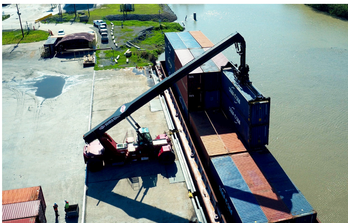
SEACOR moves barges with cargo-filled containers from Baton Rouge to New Orleans for export.

We look forward to working with our maritime partners, Port stakeholders and our Board of Commissioners to bring jobs and industry to the Port region in the months and years ahead.