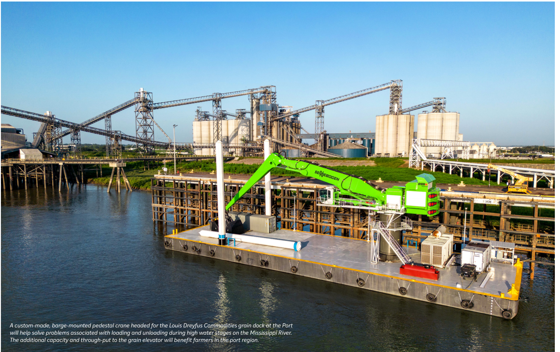
A custom-made, barge-mounted pedestal crane headed for the Louis Dreyfus Commodities grain dock at the Port will help solve problems associated with loading and unloading during high water stages on the Mississippi River. The additional capacity and through-put to the grain elevator will benefit farmers in the port region.